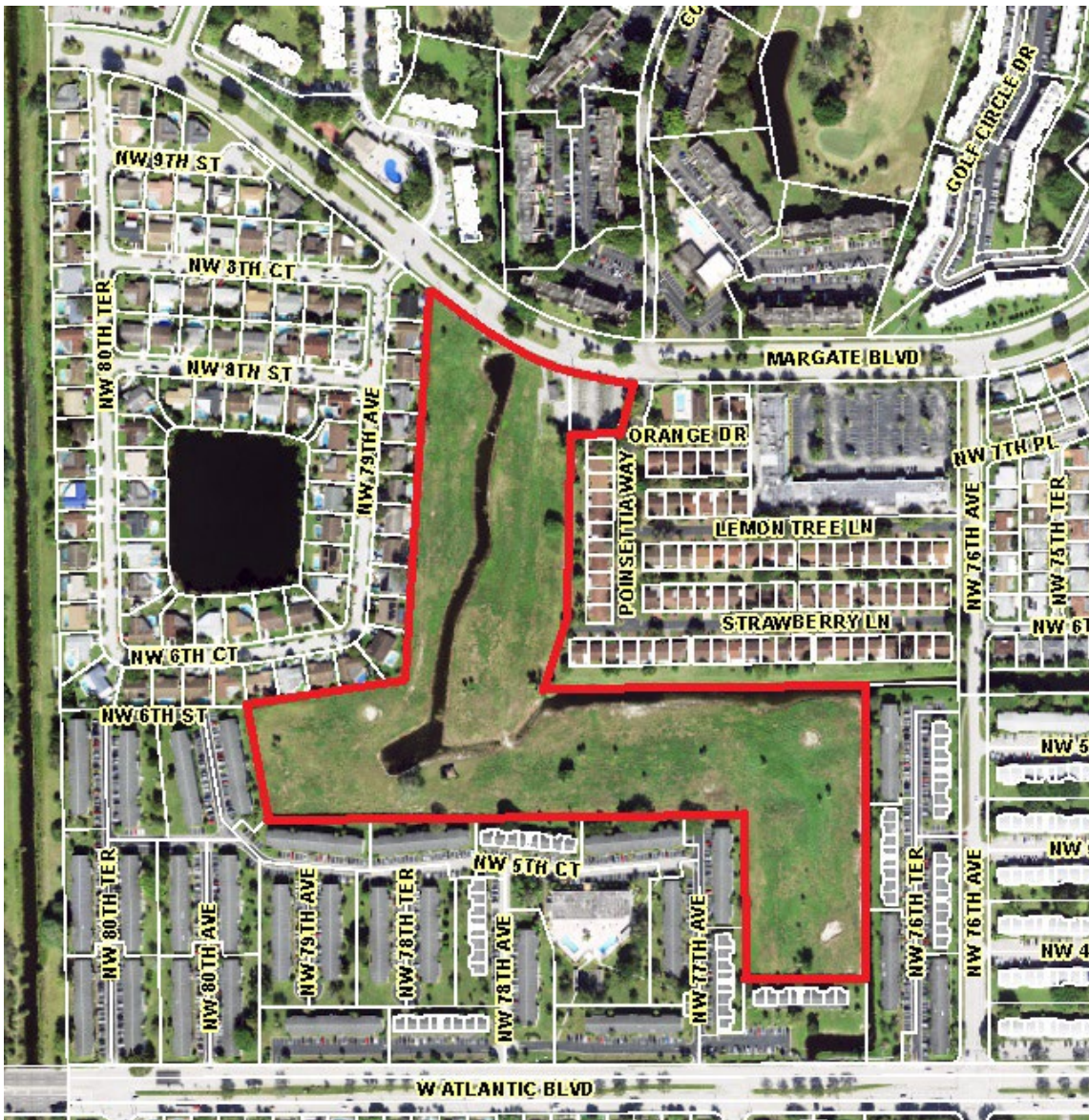
[Subject Property – Current Condition]