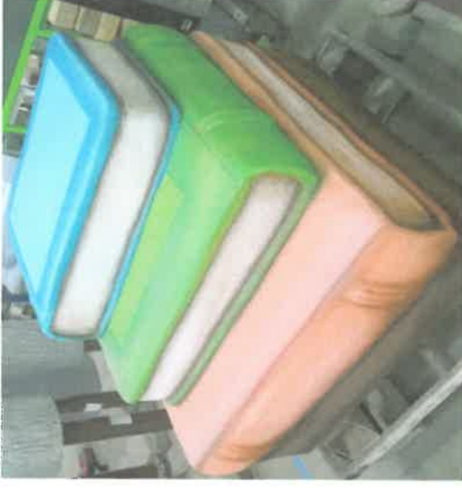
LSI GFRC Book stack - Reference Picture Only

Concepts only and is subject to change based on new info