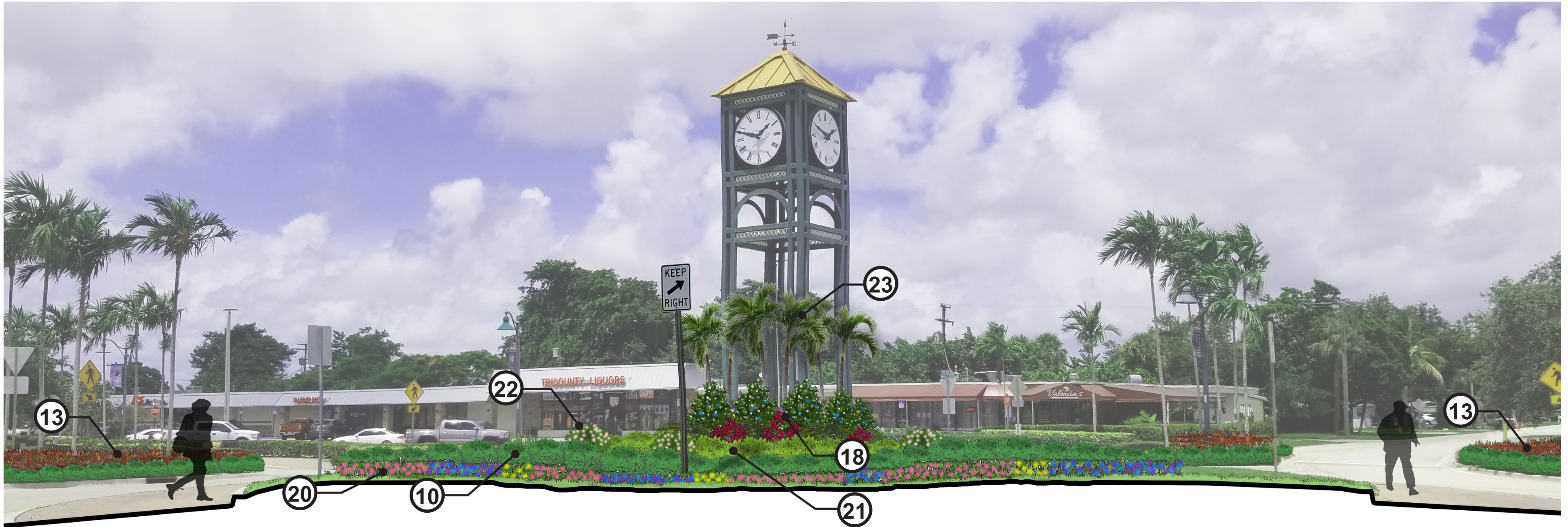
ROUND-A-BOUT ELEVATION DETAIL