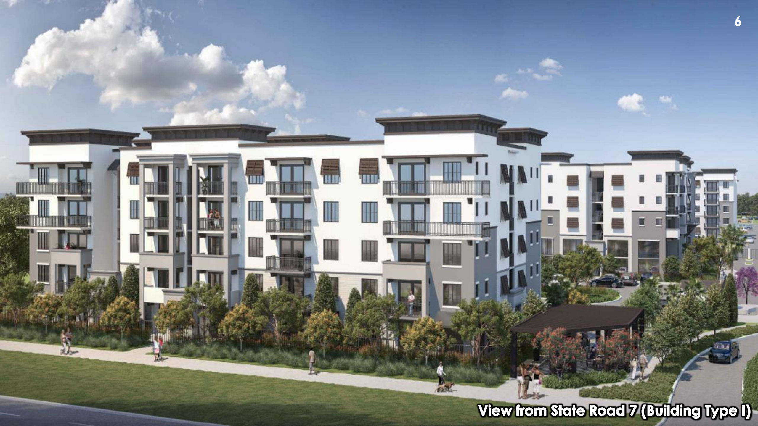
View from State Road 7 (Building Type I)