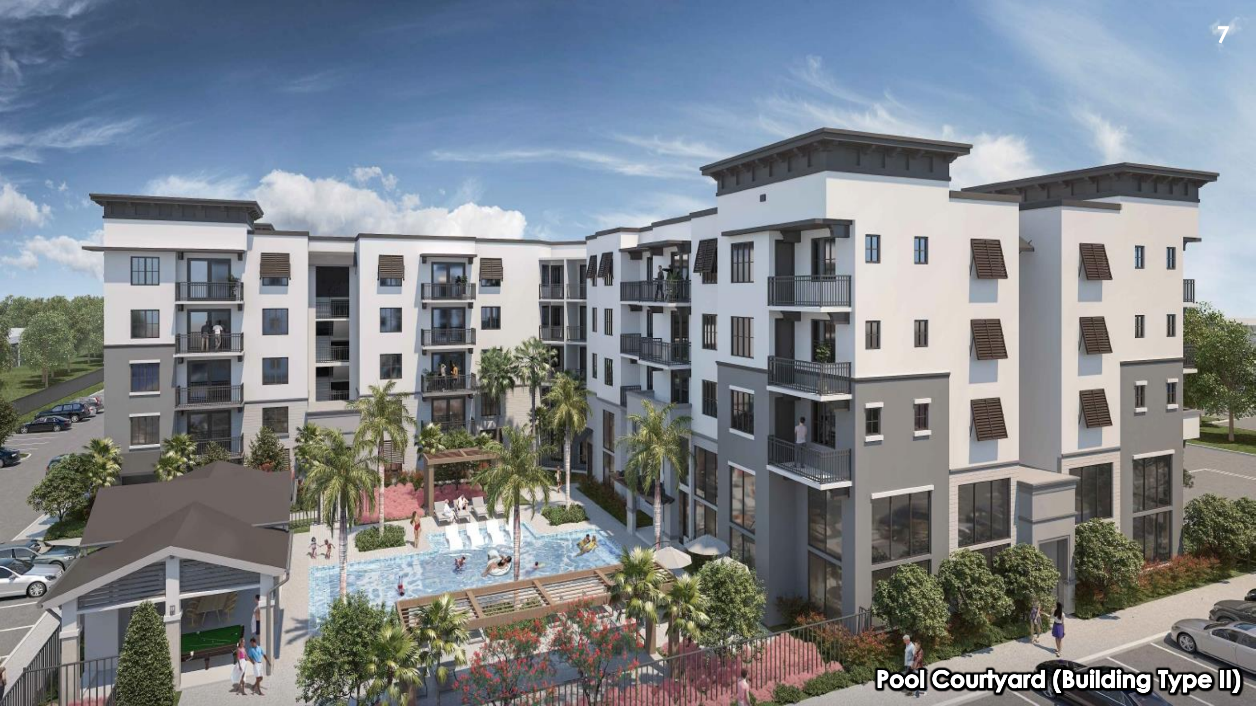
Pool Courtyard (Building Type II)