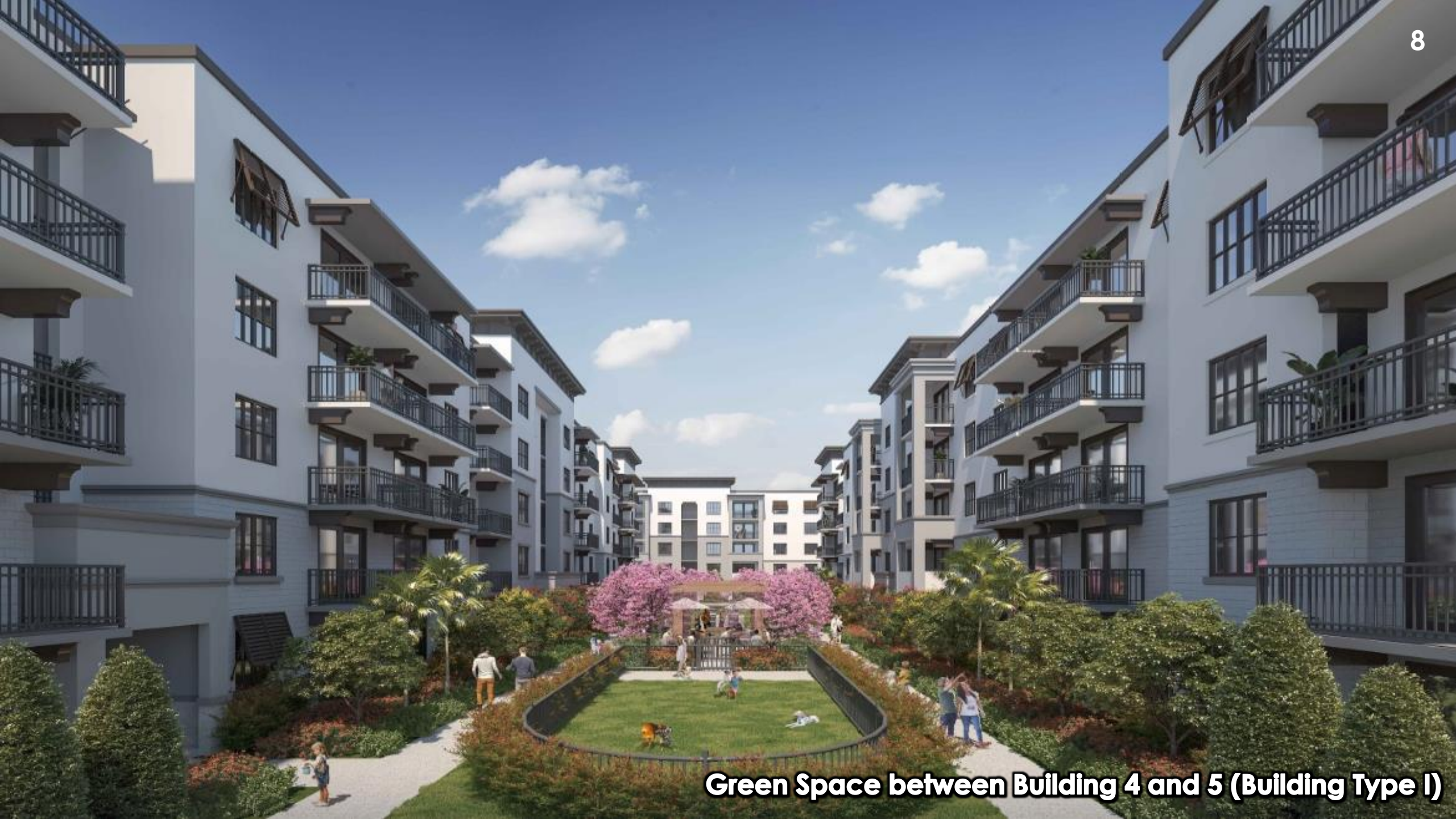
Green Space between Building 4 and 5 (Building Type I)