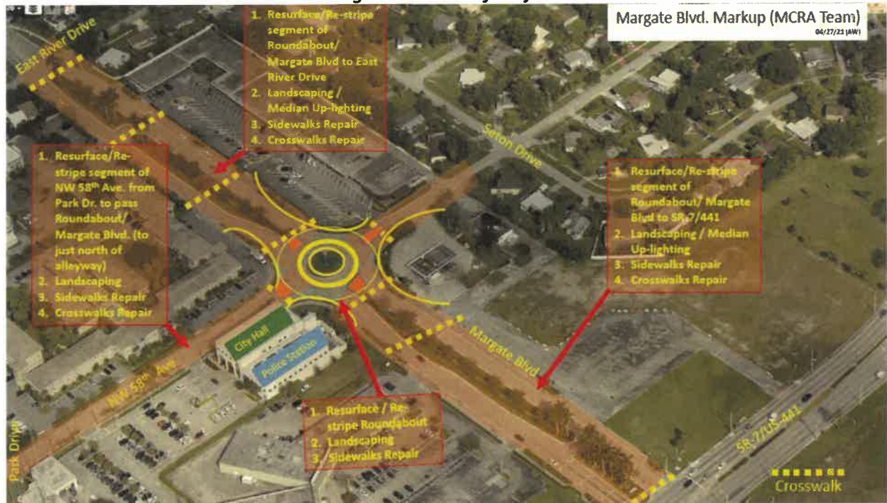
Figure 1: Limits of Project

The scope of services our firm shall provide as per the scoping email (Figure #1) dated April 27, 2021, provided by your office as well as, field meeting between City Staff and CMA on April 28, 2021.