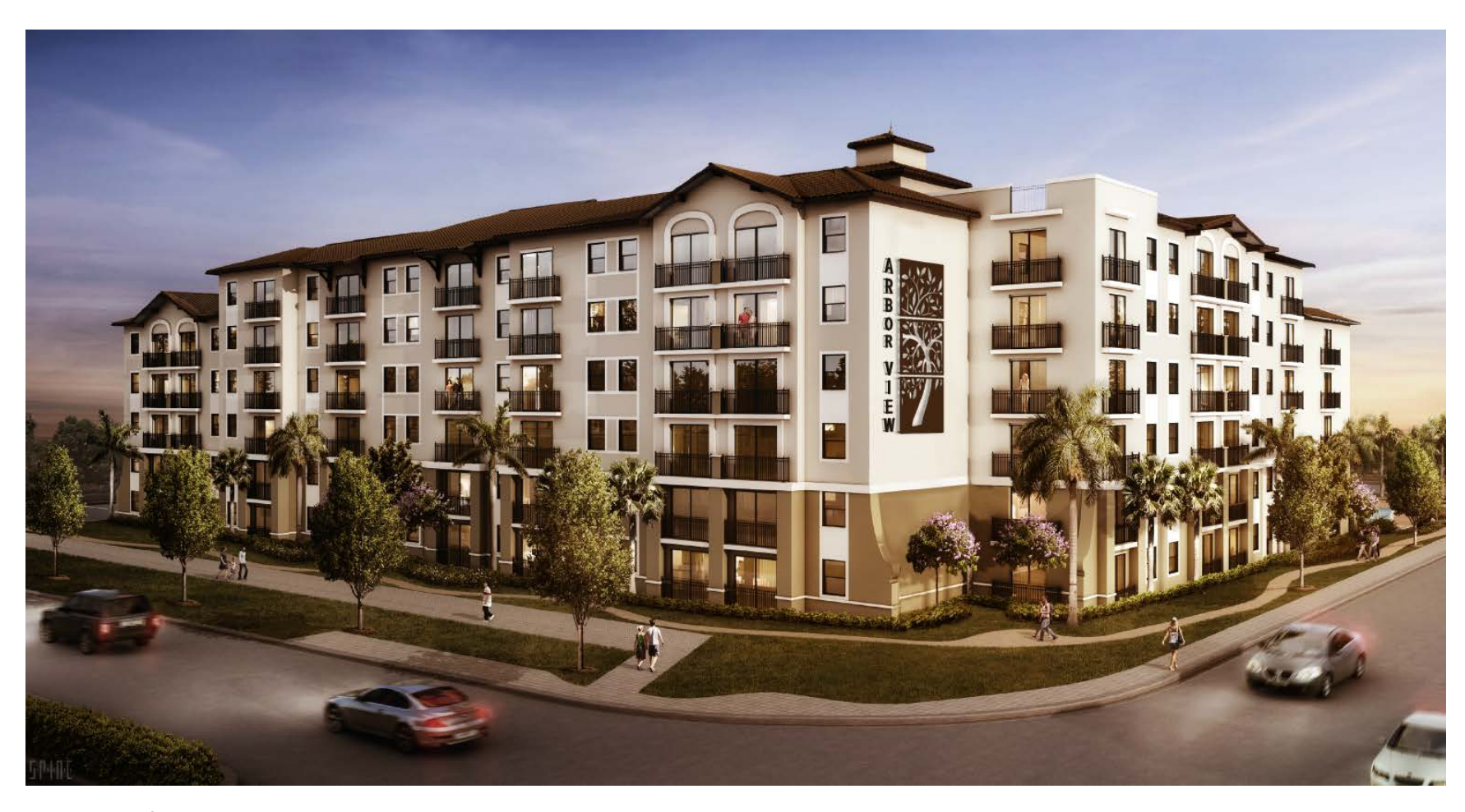
Rendering of Corner