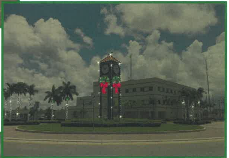
Wreath with Bow Option