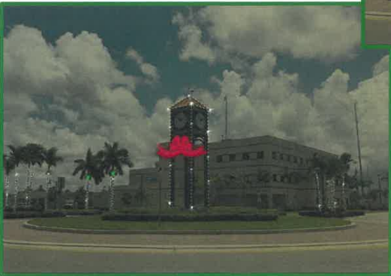
Glitter Bow Option