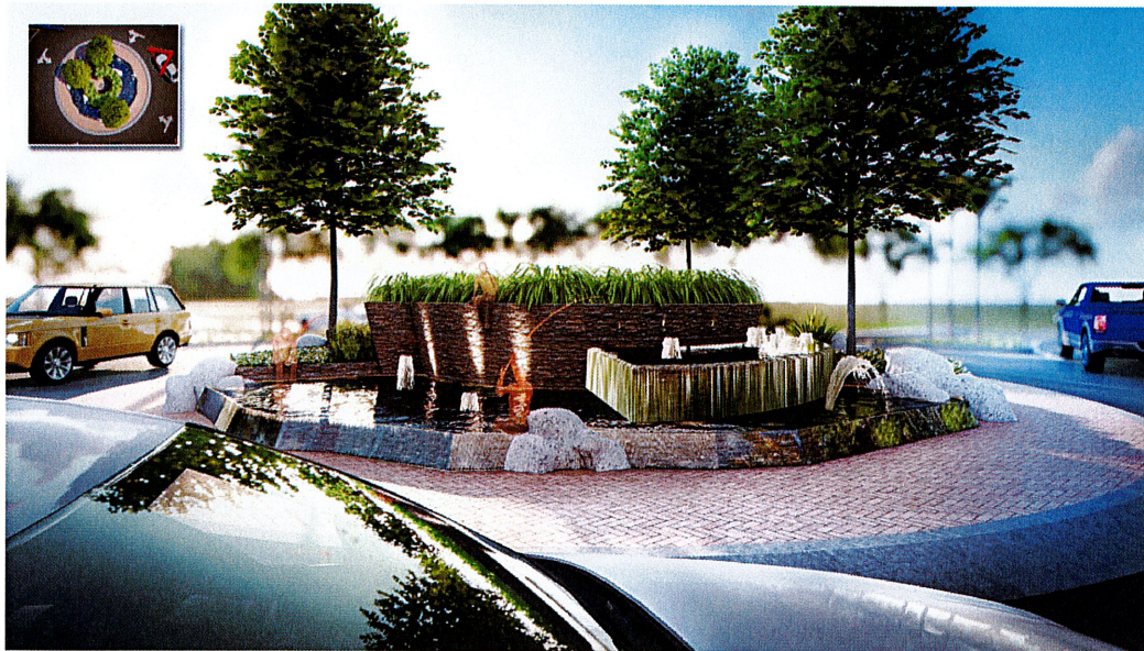
Image of conceptual Design -

CONSULTANT is to provide professional services associated with Winfield Blvd. Traffic Calming and Streetscape Improvements for the section of roundabout located on Winfield Blvd in Margate, FL.