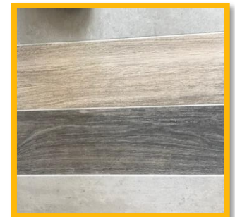
Proposed tile colors