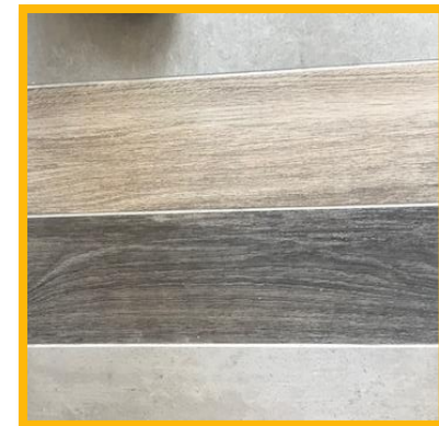
Proposed tile colors