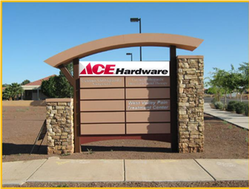
Sample Monument Signs