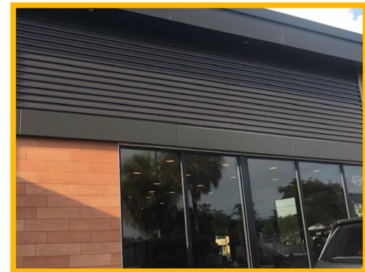
Proposed corrugated metal