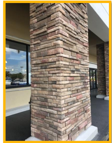
Proposed stacked stone