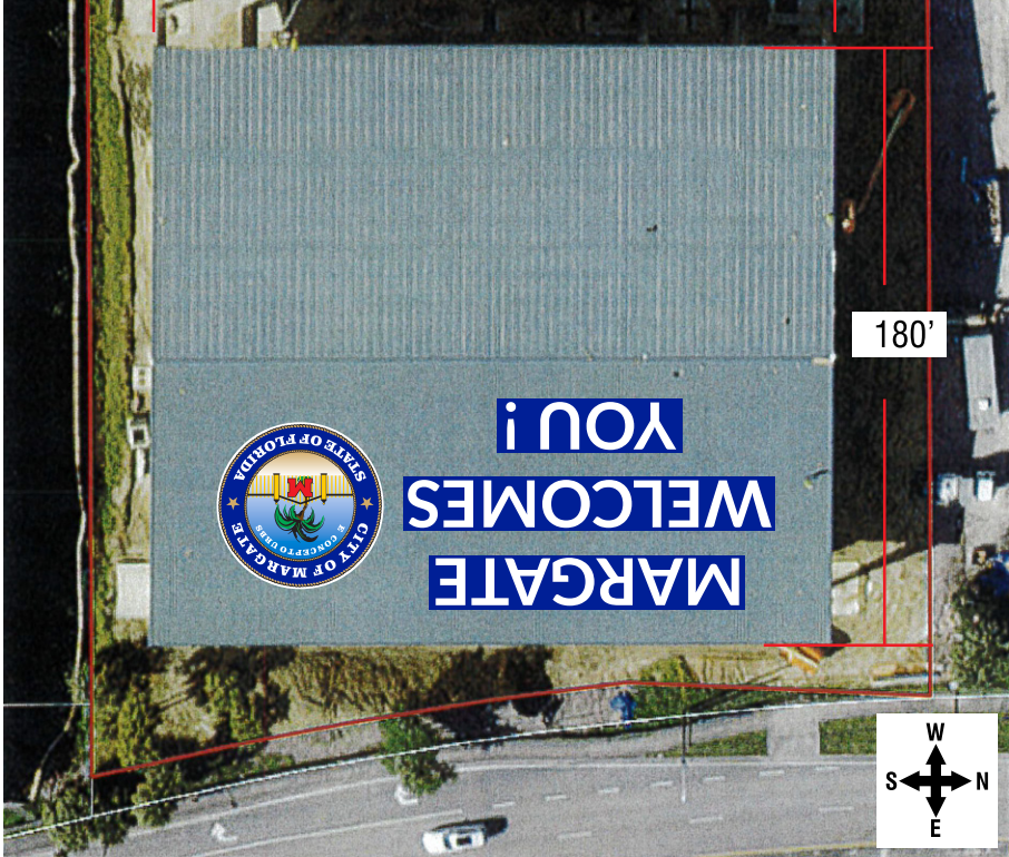
Elevation: 1/64" = 1'-0"