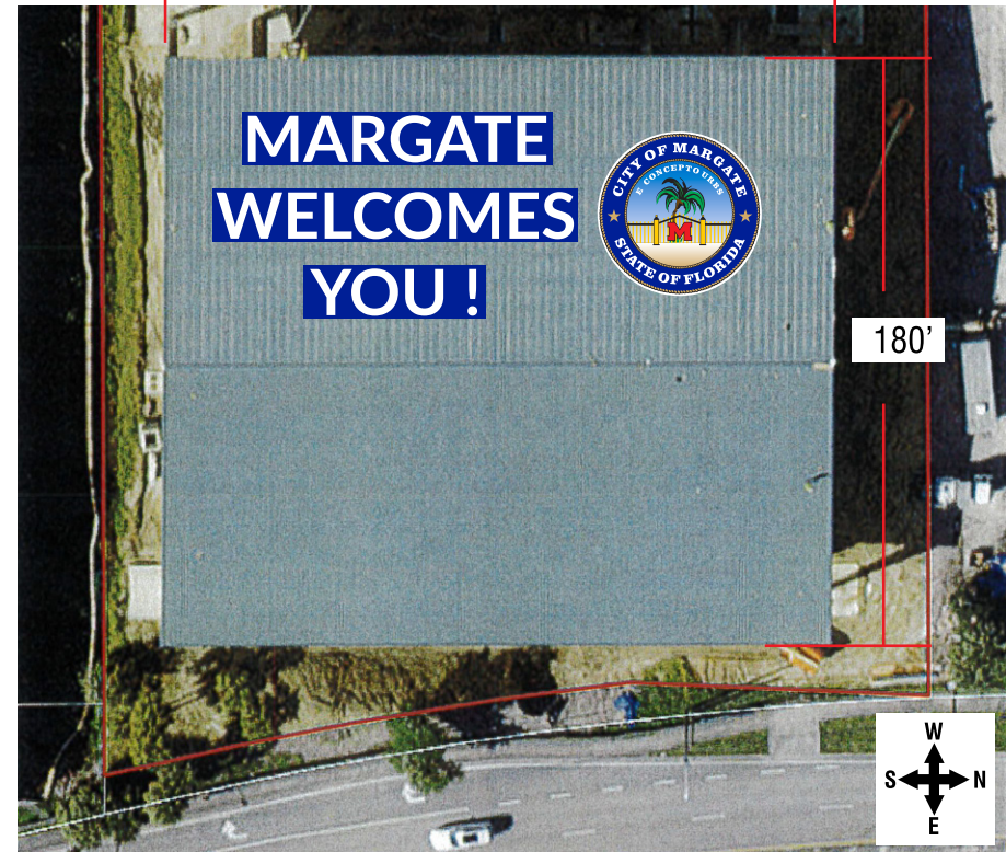
Elevation: 1/64" = 1'-0"