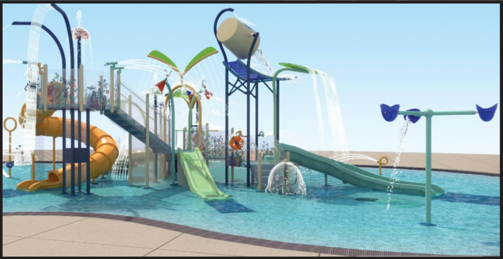
VORTEX - SPLASH PAD