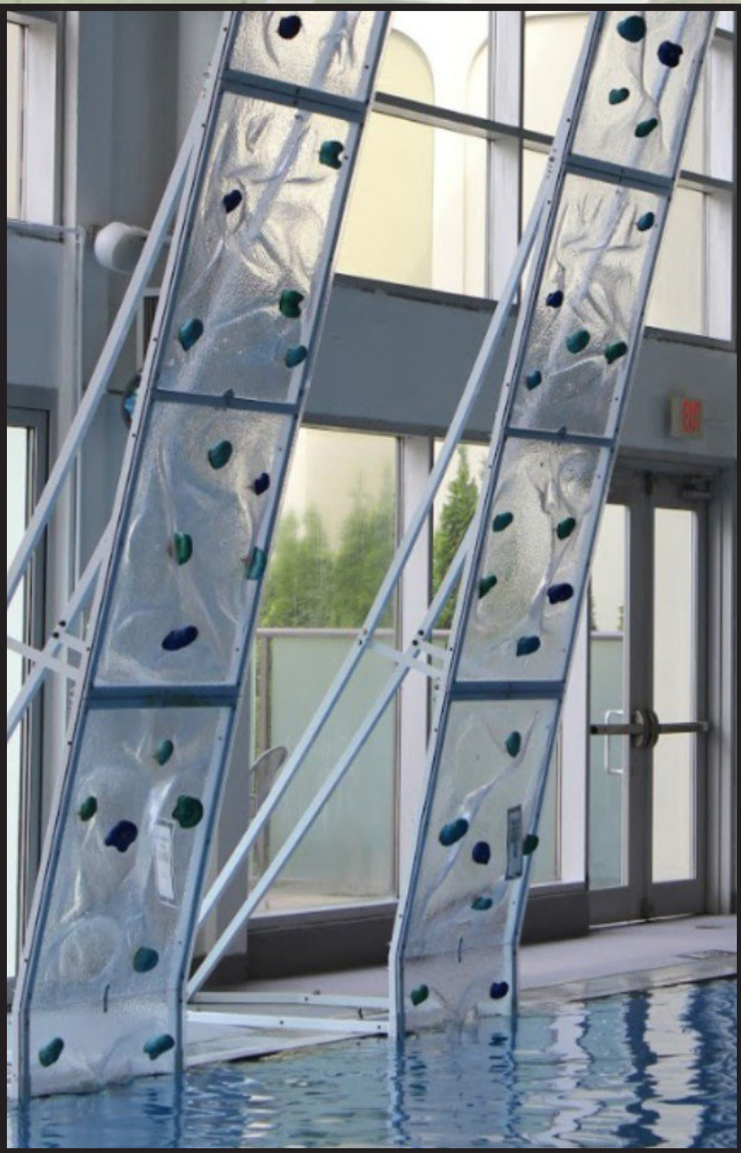
AQUACLIMB - CLASSIC 2 PANELS SEPERATED 4 PANELS HIGH (13'-1")