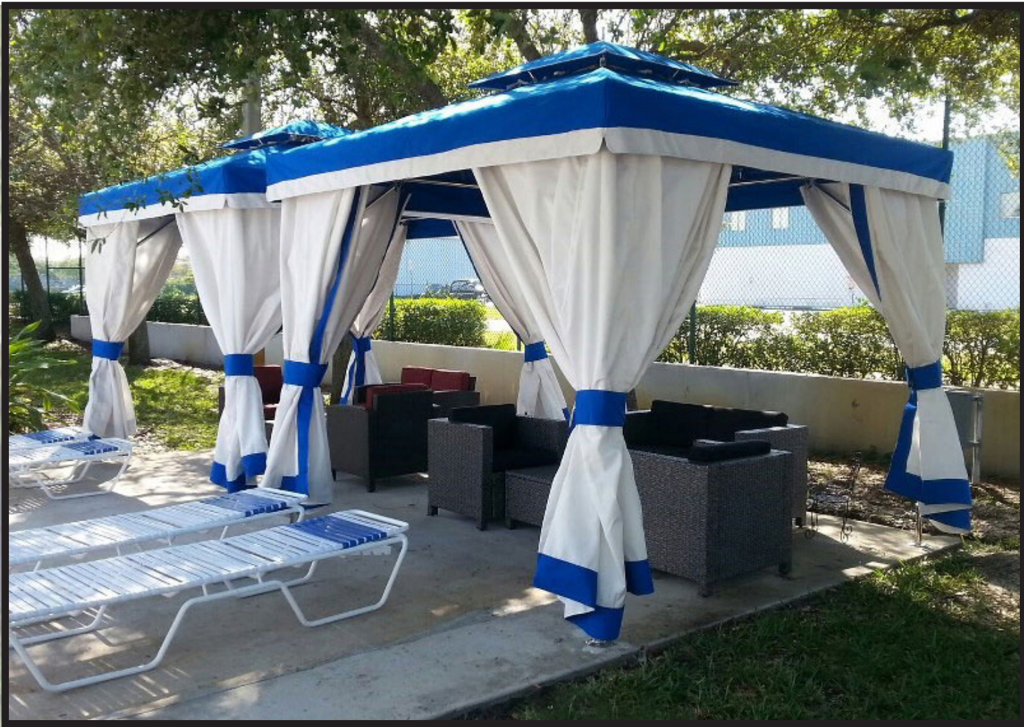
PRIVATE CABANAS (8'X16')